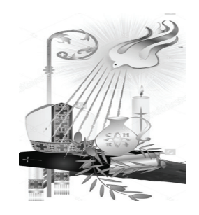
TRINITY SUNDAY LIVING WITH CHRIST

Merciful people don't hold a grudge or try to even the score. They let it go, give whatever happened to God, and forgive. Forgiveness allows you to let anger, hurt, and bitterness drain out of your heart. It restores a sense of peace to our soul. Without forgiveness you become a prisoner to your own resentments. With forgiveness, you mirror God's mercy. Who are the people that you need to forgive?